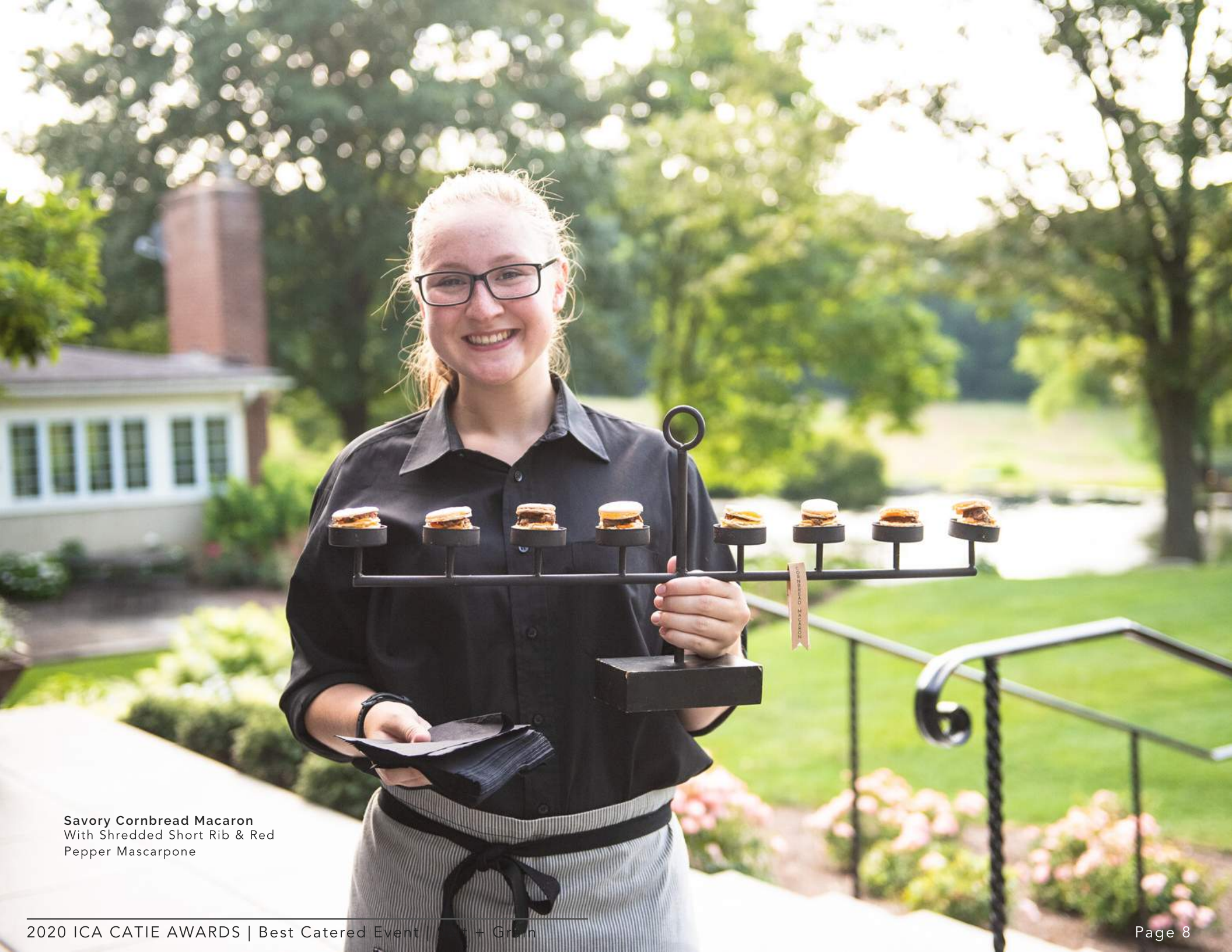
Savory Cornbread Macaron With Shredded Short Rib & Red Pepper Mascarpone