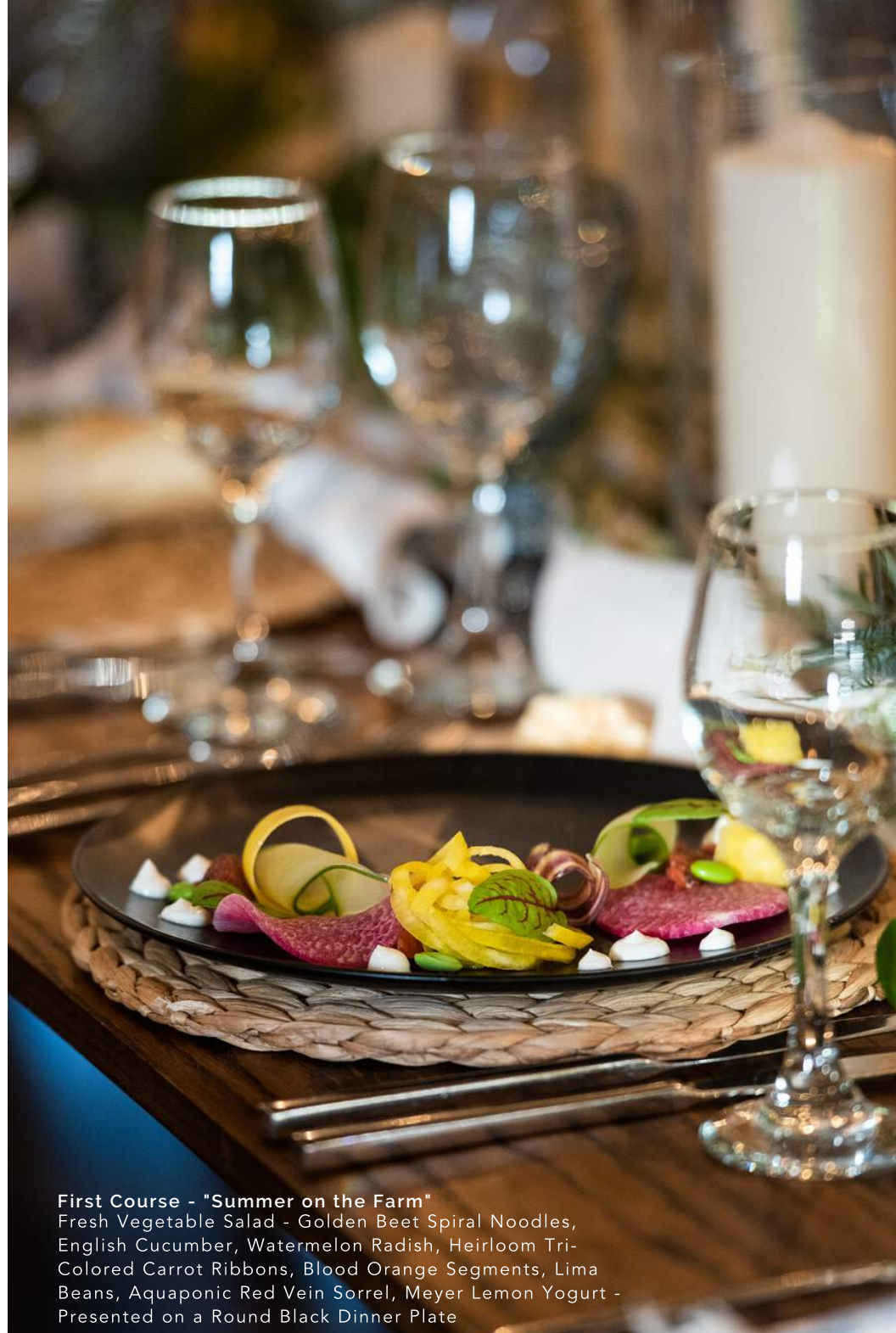
First Course - "Summer on the Farm" Fresh Vegetable Salad - Golden Beet Spiral Noodles, English Cucumber, Watermelon Radish, Heirloom Tri-Colored Carrot Ribbons, Blood Orange Segments, Lima Beans, Aquaponic Red Vein Sorrel, Meyer Lemon Yogurt - Presented on a Round Black Dinner Plate