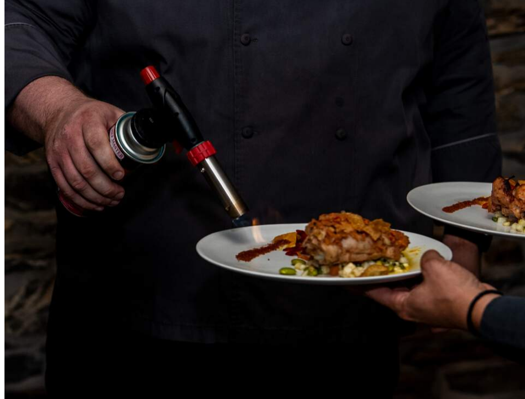
Third Course - Vegetarian / Vegan Option Mushroom and Quinoa Meatless Meatloaf - Yucca Mash, Haricot Vert, Lemon Rosemary Aioli, Frizzled Brussel Sprout Petals - Presented on a Round White Dinner Plate