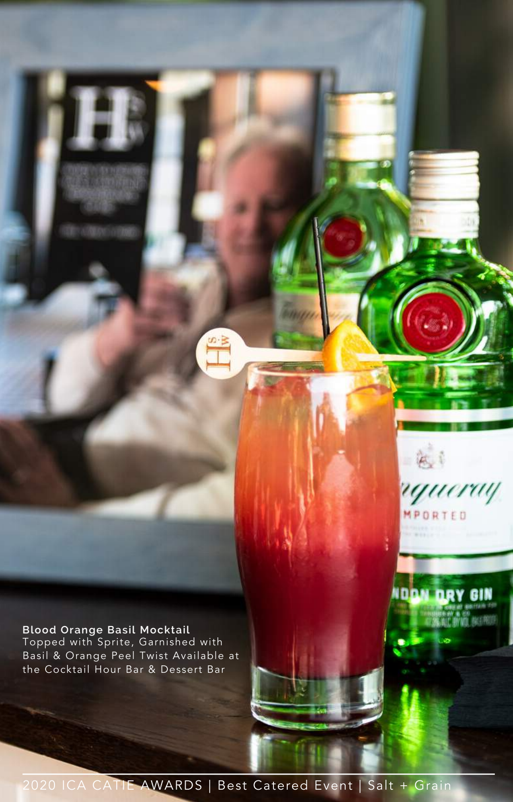
Blood Orange Basil Mocktail Topped with Sprite, Garnished with Basil & Orange Peel Twist Available at the Cocktail Hour Bar & Dessert Bar