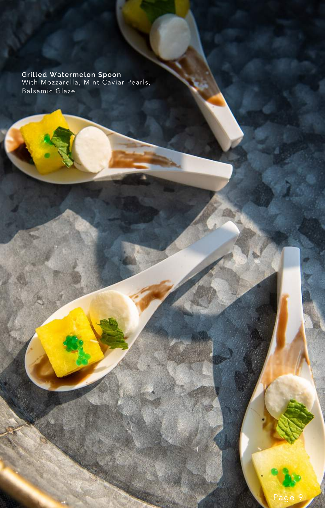
Grilled Watermelon Spoon With Mozzarella, Mint Caviar Pearls, Balsamic Glaze