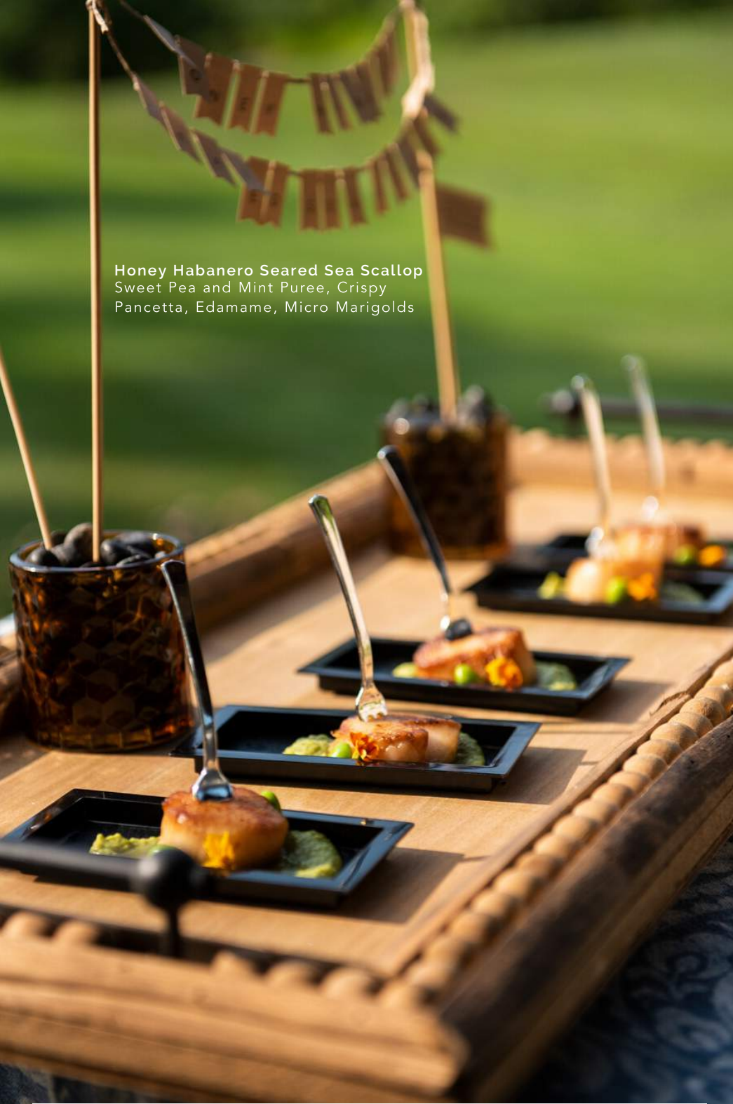
Honey Habanero Seared Sea Scallop Sweet Pea and Mint Puree, Crispy Pancetta, Edamame, Micro Marigolds