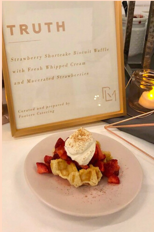
Strawberry Shortcake Biscuit Waffle with Fresh Whipped Cream and Macerated Strawberries