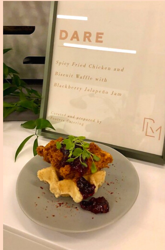
Spicy Fried Chicken and Biscuit Waffle with Blackberry Jalapeño Jam