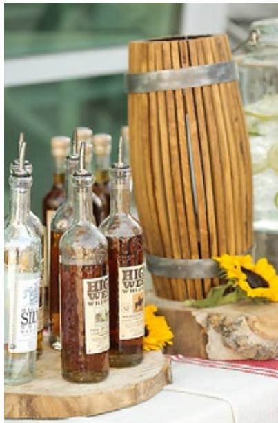
Local High West Whisky selections with descriptions of flavors and pairings