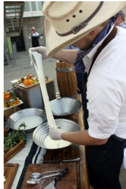
Our third action station featured fresh mozzarella pulling, and a bounty of local heirloom tomatoes, fresh basil and charcuterie. Local Creminelli Salumi was a highlight in addition to the mozzarella pulling. You wouldn't think authentic Italian salumi is local in the U.S. mountain west, but we are lucky to have a fourth generation salumi artisan in our state.