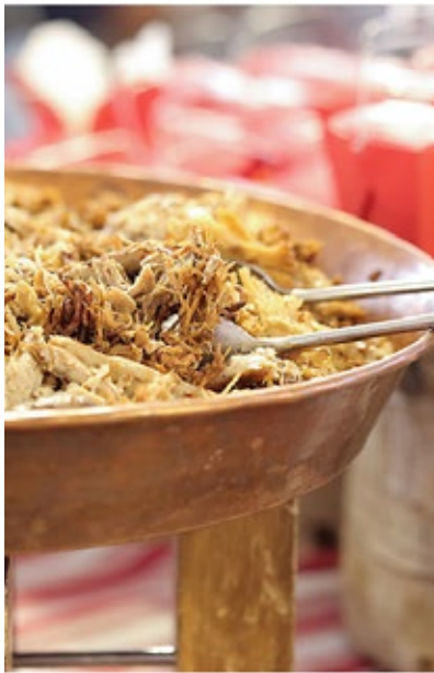
Western BBQ Pulled Pork