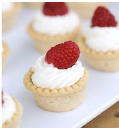
Key Lime Tarts