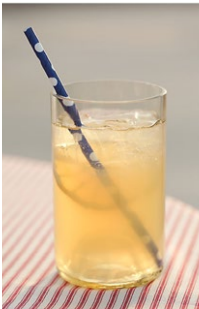
Signature Cocktail: Lavender-infused Lemonade with Gingered Dried Lemon Wheel and High West Whiskey