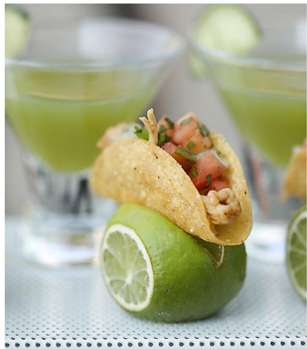
Southwestern Chili Lime Chicken Tacos