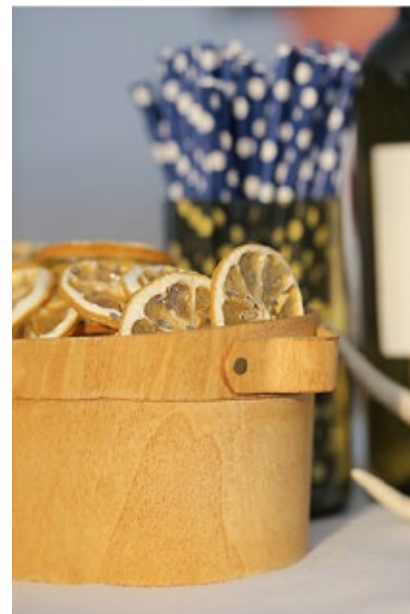
Gingered Dried Lemon Wheel