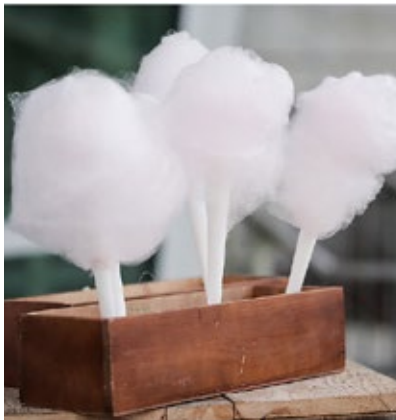
Cotton Candy lollipops