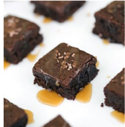
Mini Black Satin fudge cake fork bites