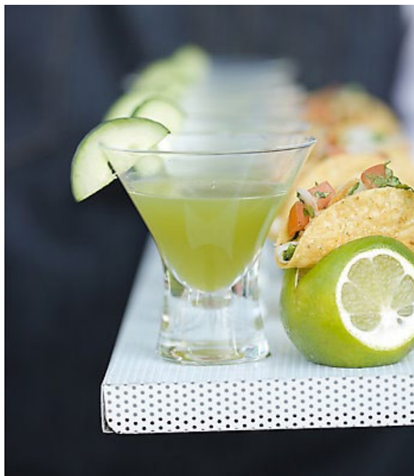
Mini Cucumber, Lime, and Basil Margarita