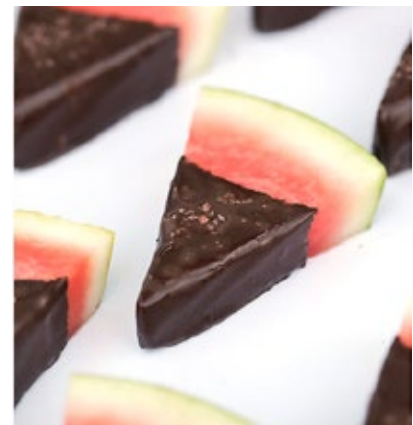
Salted Chocolate-dipped Watermelon wedges