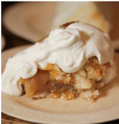
Homemade Peach Cobbler in Dutch Ovens with whipped cream