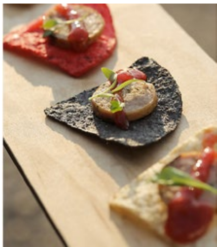
Rattle Snake Sausage with Raspberry Chutney on Corn Chip