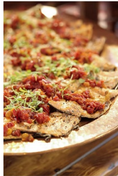
Mesquite Grilled Red Trout with Sweet Tomato Jam