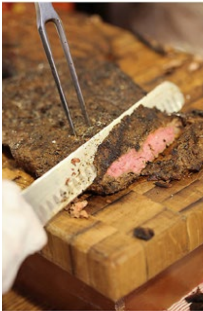
Mesquite-Grilled Cumin-crusted Flank Steak with Chimmichuri Sauce