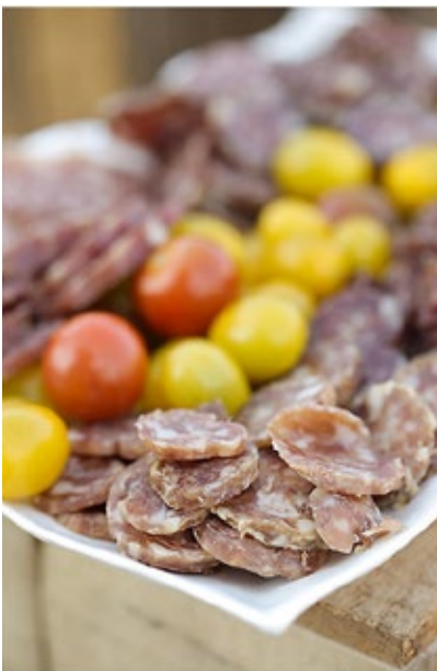
Local Creminelli Salumi charcuterie and condiments